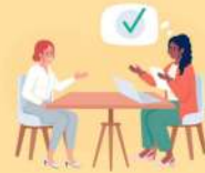
Parent Teacher Interviews